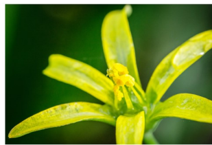
Yellow Star of Bethlehem

Although the Wayland Photography Challenge will not be launched until June with the exhibition in August, now may be a good time to get out and about in the Wayland countryside. The warm weather has brought on the spring flowers— we saw banks of primroses at the weekend and the daffodils will be out in Merton, closely followed by the bluebells in Wayland Wood.