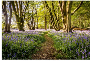
Wayland Wood Bluebells