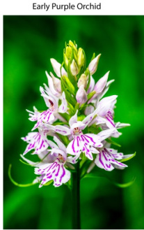
Early Purple Orchid